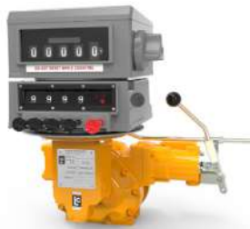
M-7 class 3 meter with mechanical register

Liquid Sweeteners and Syrups, Dextrose, Fructose, Sucrose, Maltose, Lactose. Corn Oil, Soy Bean, Cotton Seed and Coconut Oils, Shortenings