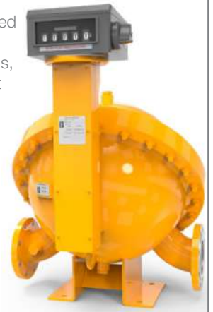
MSAA-75 class 14 meter with mechanical register