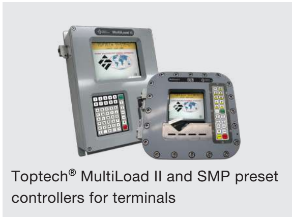
Toptech ® MultiLoad II and SMP preset controllers for terminals