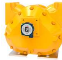
M-30 class 14 meter with POD for LCR.iQ

Crude Oil, LACT, NOD, Heated and/or Viscous Liquids Including: Animal Fats, Resins, #6 Oil, Non-Abrasive Asphalt Emulsions