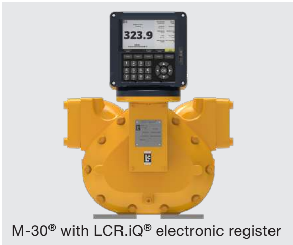
M-30 ® with LCR.iQ ® electronic register