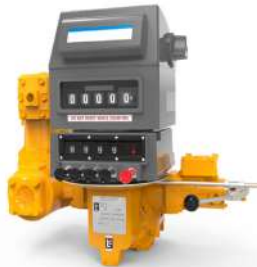
M-5 class 4 meter with register and printer

Potted, treated, deionized, and demineralized Water, Windshield Washer Fluid and Solvents where no red metals are allowed