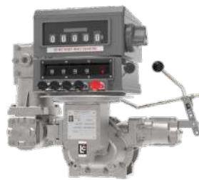
M-7 class 8 stainless steel meter with register

Acidic pH Liquids, Nitric, Phosphoric and Glacial Acetic Acids, Fruit Juices and Vinegar, Distilled Water